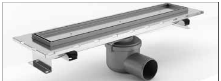
Channel 100 for Tiles with gluing flange, Tile Insert Grate, Central Outlet; with a Side 50mm outlet gully

The Channel 100 has been used in many projects throughout the UK. The system is ideal for leisure and hotel areas and has been installed in changing room areas at the Wilton Centre Gym (pictured), Sports Direct Fitness , Inverness Leisure Centre and Southampton Training Ground .