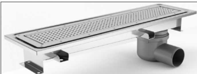
Channel 100 for Vinyl, Chess Grate, End Outlet; with a Side 50mm outlet gully

Many different configurations are available as standard - you have a choice of four grate types plus the Tile Insert grate if installing into a tiled floor finish; and the outlet can be positioned in the centre or the end of the channel. The Chess and Wave patterned stainless steel grates are ideal for bare-foot areas whilst the L15 and M125 load-bearing mesh grates are designed to suit heavy-duty industrial use. Bespoke channels in different lengths and/or 316 grade acid-resistant stainless steel, as well as many other modifications, can also be designed and manufactured to your requirements. Please contact us for details.