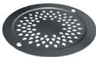
S-Series Drop grate for vinyl Prod. code: 7129507

Different stainless steel grate options are available depending on whether your 59mm floor gully will be installed into a tiled or vinyl floor.