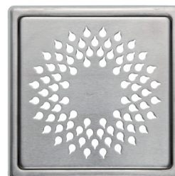
PK200 Drop grate for tiles Prod. code: 7138376 Other designs are available